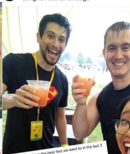
janmauw Hands down the best fest we went to in the last 2 years 🌧️ rain and everything